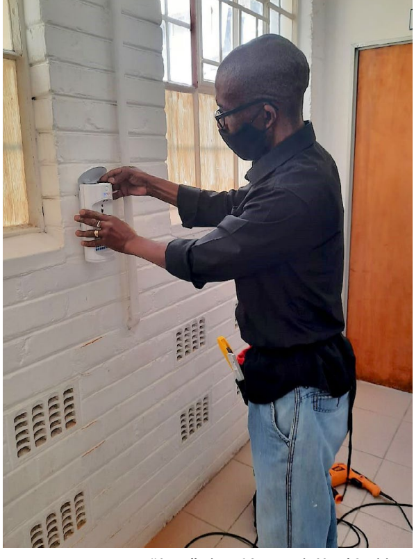
// Installation of Automatic Hand Sanitisers

Page 7 | ThisWeek@FortHare Vol 2, issue 19